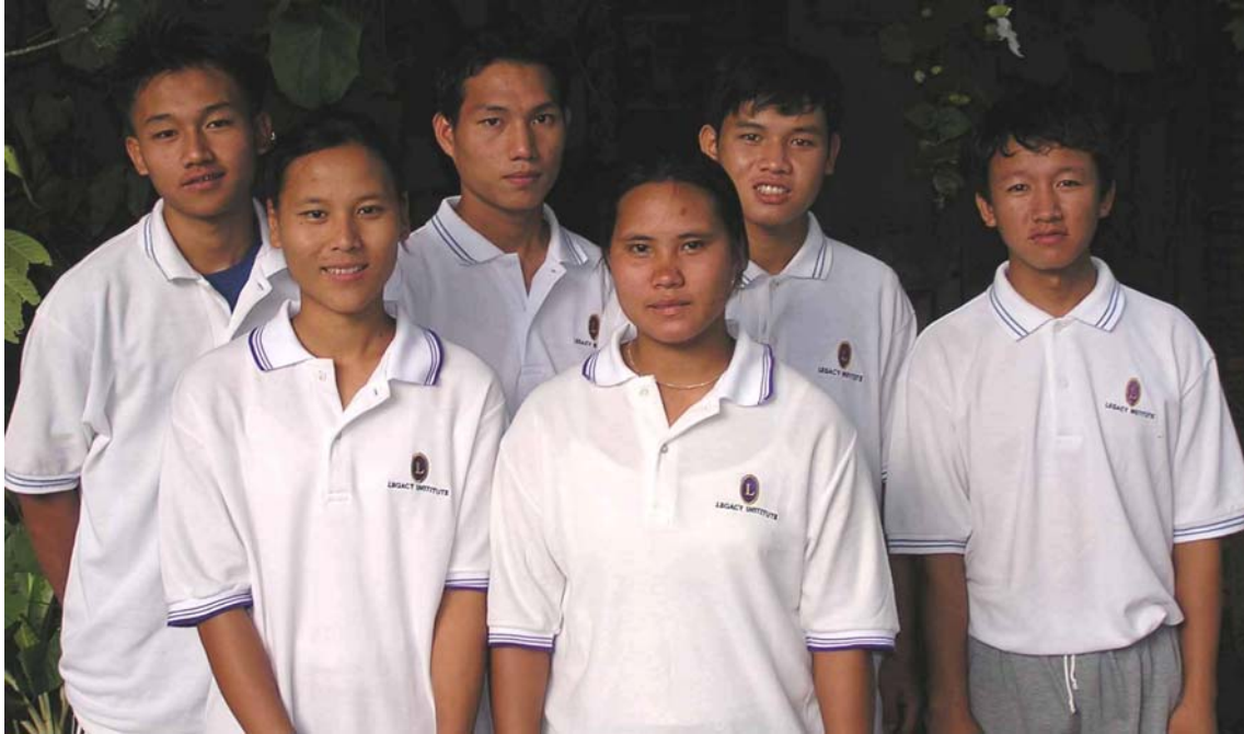
New Legacy Students from Lahu and Hmong Tribes