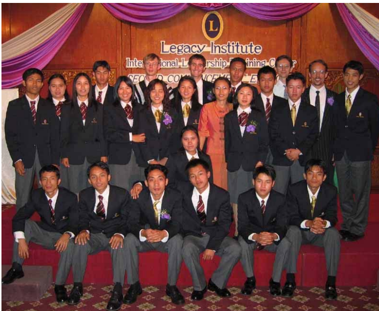
LEGACY GRADUATES, UNDERGRADUATES AND VOLUNTEER TEACHERS POSE FOR GROUP PHOTO.