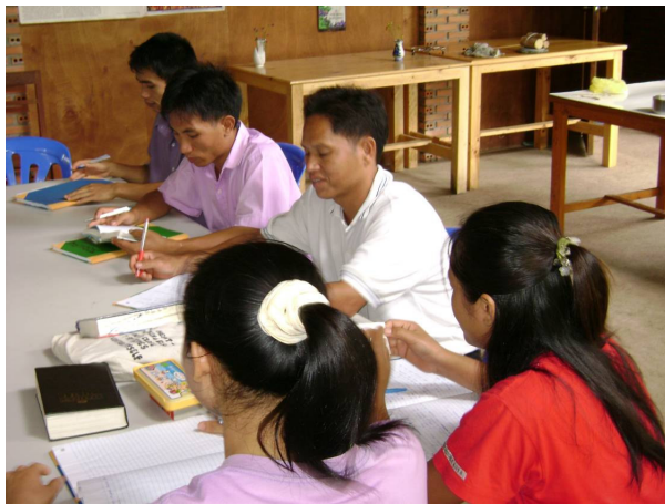
Students from the Lahu, Kachin and Karen mountain tribes study Bible at Legacy

Why did she come to Legacy? She said, “I just knew I wanted to come.” In her very limited free time she is learning to play the guitar.