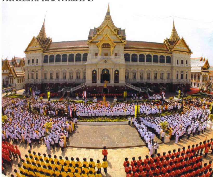
Fish-eye view of royal audience at Chakri Throne Hall