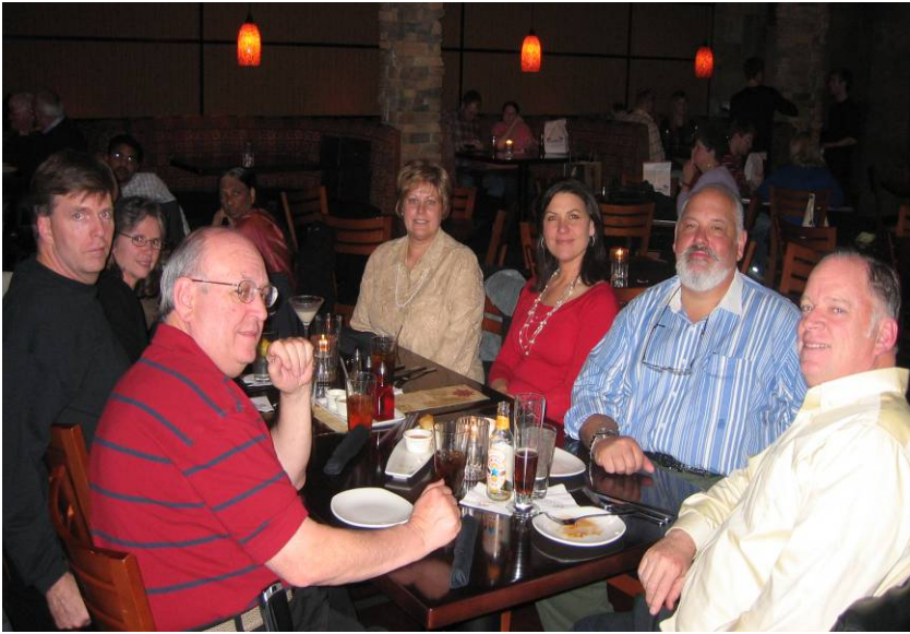
Legacy board members and friends meet for dinner in Lexington, Kentucky.