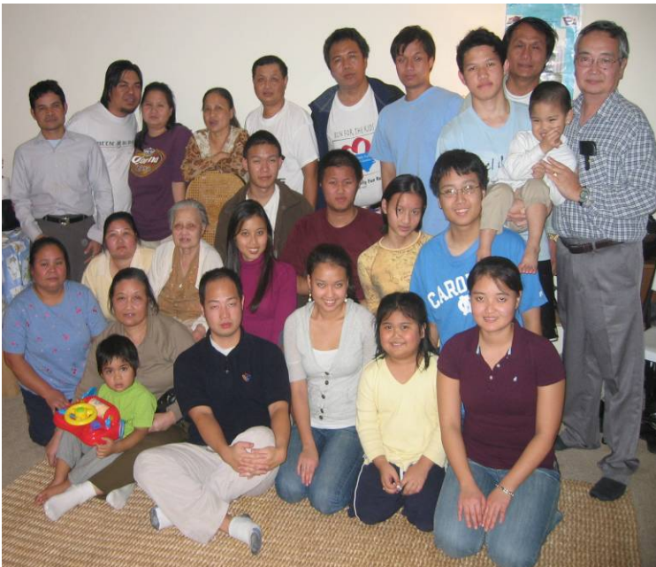
Karen COG families