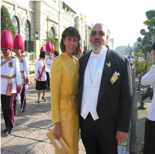
Leon and Gloria attend royal audience

People traveled from distant parts of the country to line the streets in yellow shirts (the king's color) to wait for the king's royal cavalcade. King Bhumibol is highly revered in Thailand and for an ordinary Thai person to even catch a glimpse of the king is a once-in-a-lifetime experience. Even with the special car pass we had been given by the king's secretariat, we were still delayed as traffic started jamming up because buses were parking on the streets around the palace to disgorge the thousands upon thousands of faithful subjects.