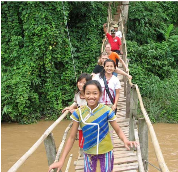
Legacy Teachers and refugees cross river into Mae Surin Refugee Camp

The Feast of Tabernacles is a Festival of Hope. People who attend the Feast get to taste the reality of hope for a new and better world. This year at the Chiang Mai Feast in Thailand, we will have a few from the West coming to join us. Most attendees will be students and faculty of Legacy Institute's school and refugees from camps along Thailand's border with Myanmar (Burma). Every year we hold a Feast of Tabernacles site so that these refugees and poor students can experience a taste of that future hope.