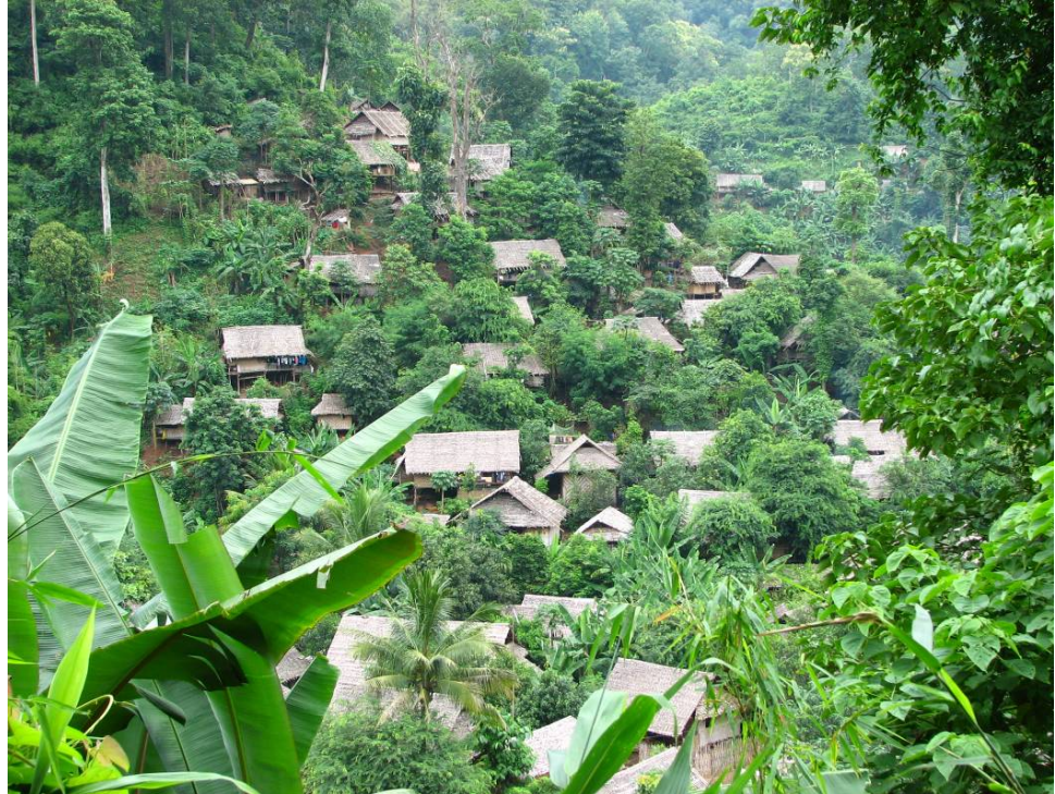
Mae Surin Refugee Camp

I have never personally experienced anything close to what they have lived through. I grew up in the United States of America with a constitution and leadership that guaranteed my rights and my freedom. I have never faced the fear of armed soldiers dragging my family members out of their homes in the middle of the night or bullets suddenly flying through the walls of my house. I have never been in prison and have never gone hungry more than a day.