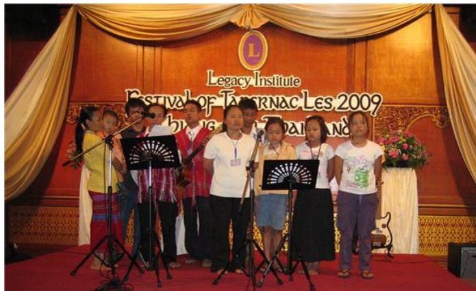
Karen members from refugee camp sing at services

We had a very exciting Feast of Tabernacles here in Chiang Mai, Thailand. Guests from the USA joined with local COG members from Myanmar (Burma), Malaysia, and Thailand to keep the Feast together and learn more about the meaning of this very important holy day season.