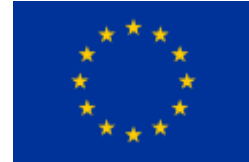
Flag of the European Union