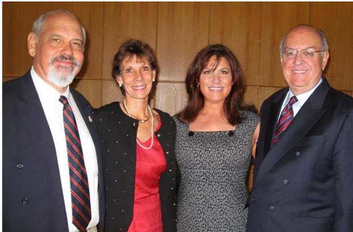
Board of Directors of Legacy Institute