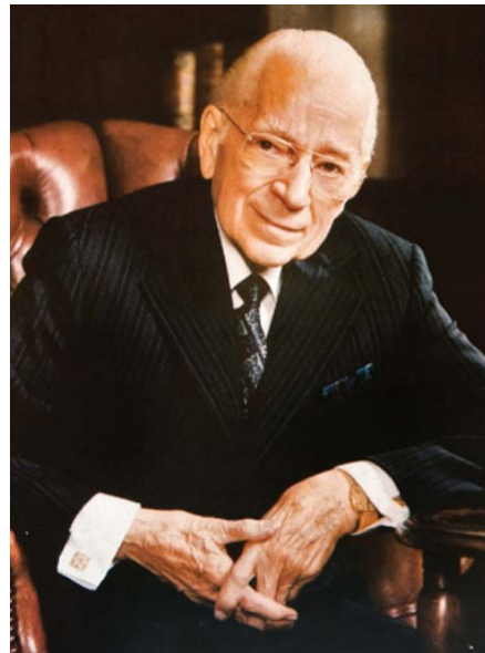
Herbert W. Armstrong 1800-1986