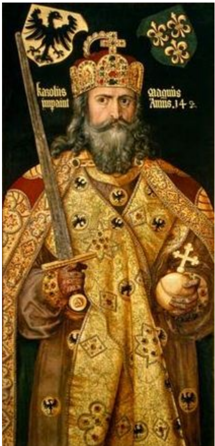
Holy Roman Emperor Charlemagne, father of both Germany and France, located in the German National Museum, Nürnberg.

Look at what is going on in Europe today. Chancellor Merkel of Germany and President Sarkozy of France are calling for modification of the treaty that created the European Union in order to save the Euro and move forward toward economic, and eventually, political unification. In order to achieve this goal, EU members will have to give up sovereignty to a supranational European governing body that will govern the finances of all 27 member nations. 26 have agreed. Only Britain refuses to join in this move.