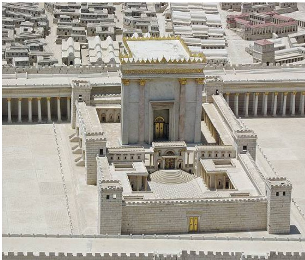
Model of 2 nd Temple in the Israel Museum, Jerusalem. 1

We all find Bible prophecy difficult to understand. That is because the Bible gives us only the outline of future events, much of it in symbolism. The Bible also uses something called dual fulfillment , meaning that sometimes there is a former and a latter fulfillment of a single prophetic event.