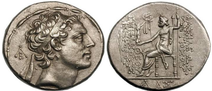
Coin struck by Antiochus IV Epiphanes. Reverse shows himself seated on throne as Zeus Olympias Holding Nike (Victory) 2

When ye therefore shall see the abomination of desolation, spoken of by Daniel the prophet, stand in the holy place, (whoso readeth, let him understand:) Then let them which be in Judaea flee into the mountains: Let him which is on the housetop not come down to take any thing out of his house: Neither let him which is in the field return back to take his clothes.