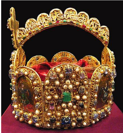
Side view of the Crown of Charlemagne. 11

political/economic empires will eventually clash over control of the city of Jerusalem and the land promised to Abraham and his covenant descendants.