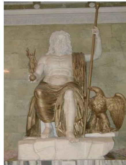
Statue of Zeus Olympus seated on throne holding Nike (Victory). Now located at the Hermitage in St. Petersburg, Russia. 10

Antiochus had grown up in Rome and became an ardent worshipper of Zeus Olympus. The next “King of the North” will assume the role of “God on Earth,” just as his precursor did over 2100 years ago. He will do so in the same location (the Temple in Jerusalem) as a false Messiah, claiming the role of Christ as King of Kings. He will be worshipped as a god by the whole world—save the true Saints.