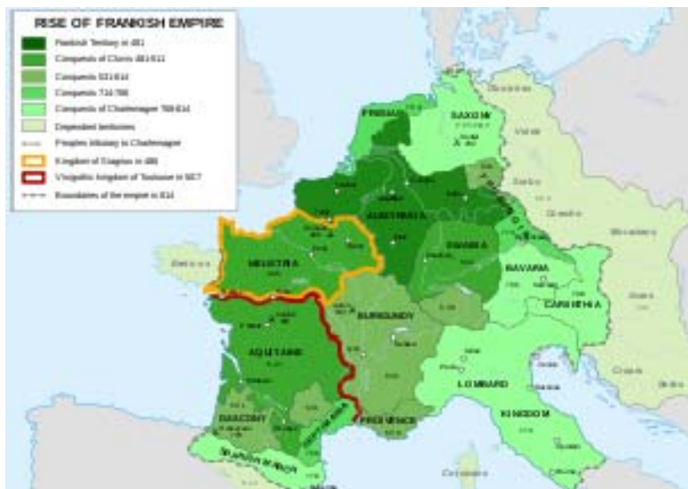
Map of Charlemagne's Empire. Both France and Germany claim Charlemagne as Father of their nation.

Angela Merkel, the Chancellor of Germany, also is a champion of tightening the belt for all participants in the European Union experiment, especially Greece, Italy, and Spain. The Germans have the strongest economy and control the biggest banks. The Germans are well known for their conservatism and are not interested in financing the irresponsible excesses of their above referenced southern partners, such as Greece, Italy, and Spain. Merkel is popular in Germany because of her hard-line stand on financial bailouts of irresponsible members. But she is under attack from the Green Party and others. No one wants to hear about fiscal responsibility and austerity, especially those on the public dole. They only want more goodies handed to them. Hence, we see the rise of the French Socialists to power. Europe is caught in the snare of an emerging entitlement society growing in power, much like their nearly bankrupt cousin across the Atlantic—the United States of America.