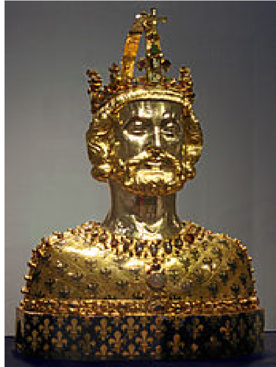
Reliquary bust of Charlemagne wearing the Imperial Crown of the Holy Roman Empire in Aachen Cathedral, with the German Eagle embossed on the metal and the French fleur-de-lis embroidered on the fabric demonstrate the idea of Germany and France united by the Charlemagne vision. 1