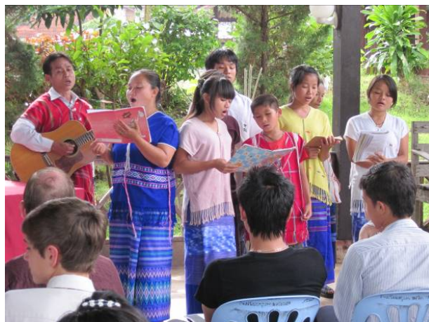
Karen tribe members sing special music

Most of our Karen tribal Church of God members are now living near Chiang Mai, so they will be attending the Feast with us in Chiang Mai this year. The Karen members are mainly refugees from Burma and typically provide special music with their own cultural flavor.