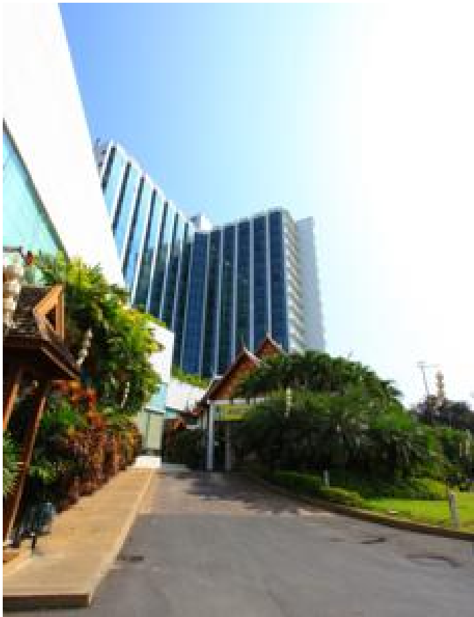
Empress Hotel Front Entrance

shopping district where Starbucks, McDonalds, Pizza Hut, and Burger King can also be found.